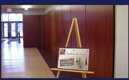
Renovations to Janse Hall's main floor in Lombard continue with the removal of lockers and addition of paneling.

The last of the university-owned houses on the south side of East Edward Street were demolished to provide more greenspace on the Lombard campus.